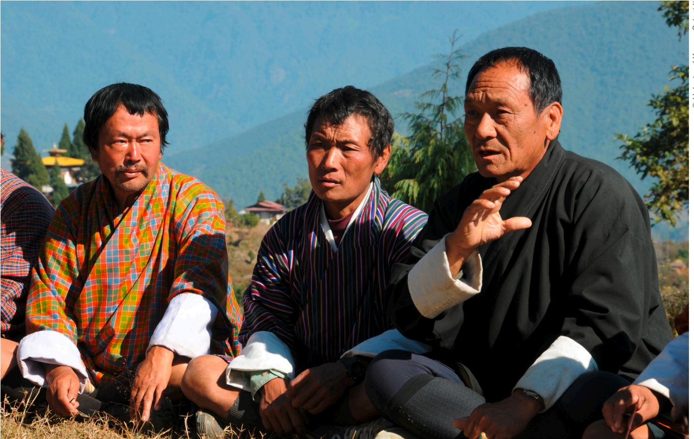
CFMG members sharing their experience on resource governance with visitors.

pabilities and abilities to shoulder responsibility for their community. Being active in a CFMG and especially in an executive committee boosts confidence in public speaking and affairs. Besides practice, targeted trainings on topics such as leadership, good governance, group management, record and book keeping have equally contributed to developing the necessary capacities for effective CF management. Thus, community forestry in Bhutan contributes in manifold ways to the development of a vibrant democracy in the country and to local democratisation.