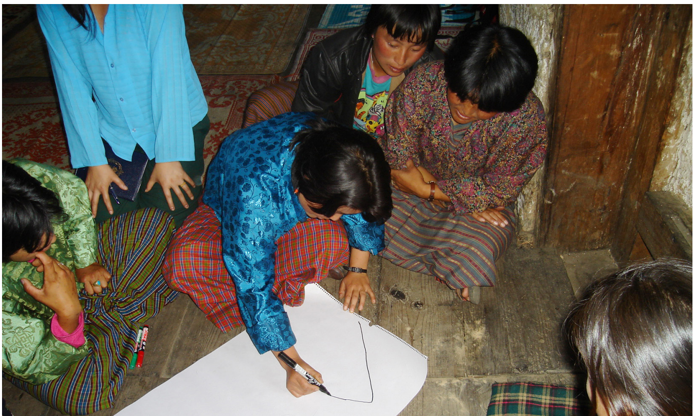
Women drawing a map of their community forest.

The CFMGs constitute themselves based on their by-laws. The general assembly of the CFMG is the highest decision-making body of the group and democratically elects the members of its executive committee. The committee is responsible for the operations of the group and accountable to its membership basis. The by-laws stipulate the application of good governance principles such as inclusiveness, equity, participation, transparency of decision making and accountability of the executive committee through record keeping and sharing information in meetings.